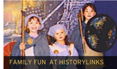
FAMILY FUN AT HISTORYLINKS