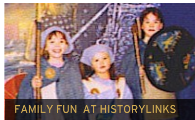
FAMILY FUN AT HISTORYLINKS

For more information: manager@dornochhub.co.uk