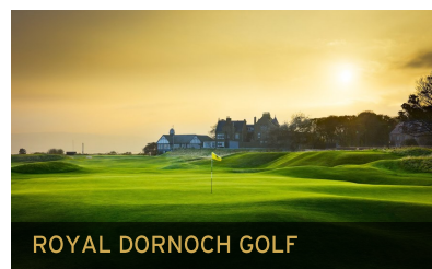
ROYAL DORNOCH GOLF