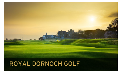
ROYAL DORNOCH GOLF