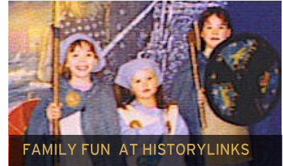
FAMILY FUN AT HISTORYLINKS