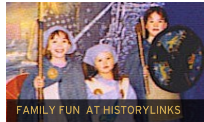
FAMILY FUN AT HISTORYLINKS

For more information: www.eventbrite.co.uk/o/lairg-district-learning-centre-30464311808