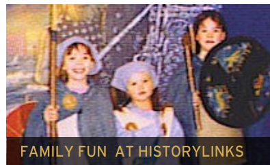
FAMILY FUN AT HISTORYLINKS

For more information: www.eventbrite.co.uk/o/dornoch-hub-45328815033