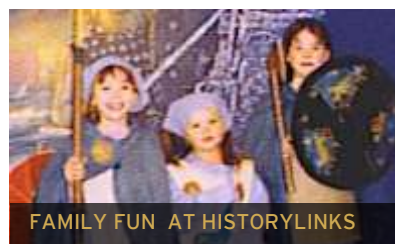
FAMILY FUN AT HISTORYLINKS