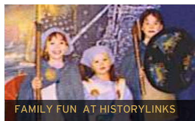
FAMILY FUN AT HISTORYLINKS

For more information, visit: www.lairglearningcentre.org.uk/events